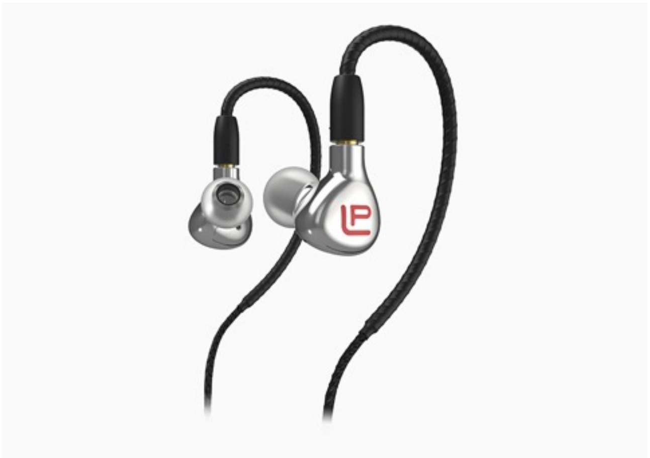
The BE90 with interchangeable MMCX cables